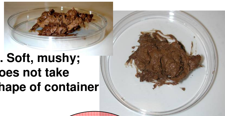
D. Soft, mushy; does not take shape of container