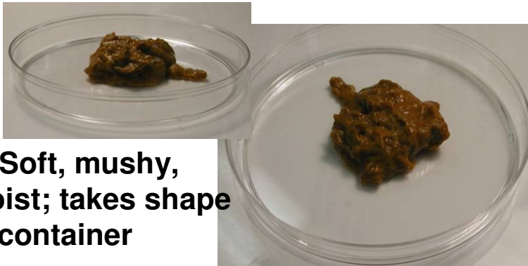
C. Soft, mushy, moist; takes shape of container