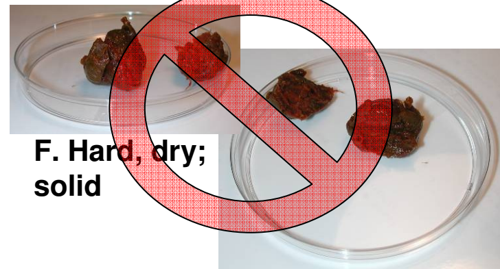
F. Hard, dry; solid