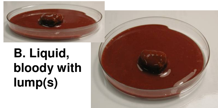
B. Liquid, bloody with lump(s)