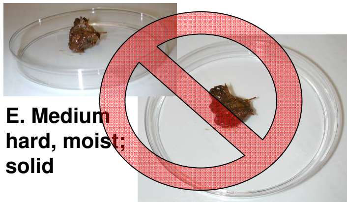
E. Medium hard, moist; solid